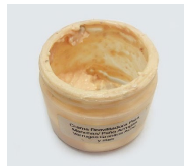
Cream collected in 2014 with hand-made label