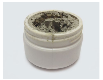
Unlabeled cream used by index case in 2013