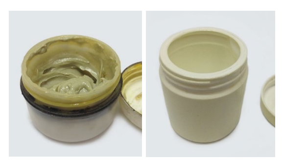
Unlabeled creams collected in 2010