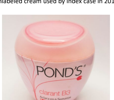
Pond's cream adulterated in Mexico in 2010.