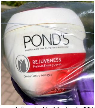
Pond's cream adulterated in Mexico in 2019. Cream is particularly toxic due to the organic mercury content.