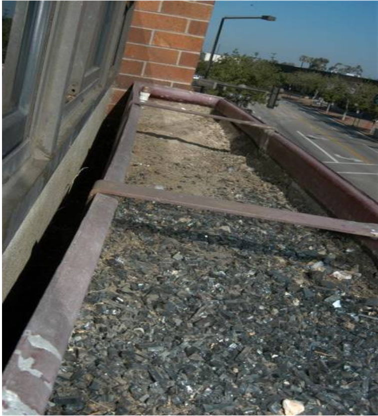
Exhibit 7. The separation between the building and another planter box.