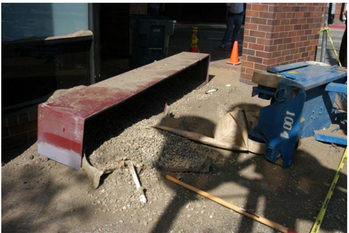
Exhibit 4. The planter box that knocked over the scissor lift.