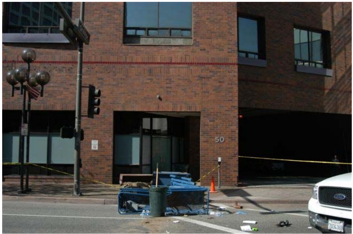
Exhibit 3. The building involved in the incident.