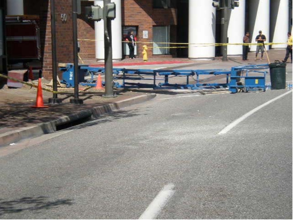
Exhibit 1. The toppled scissor lift.