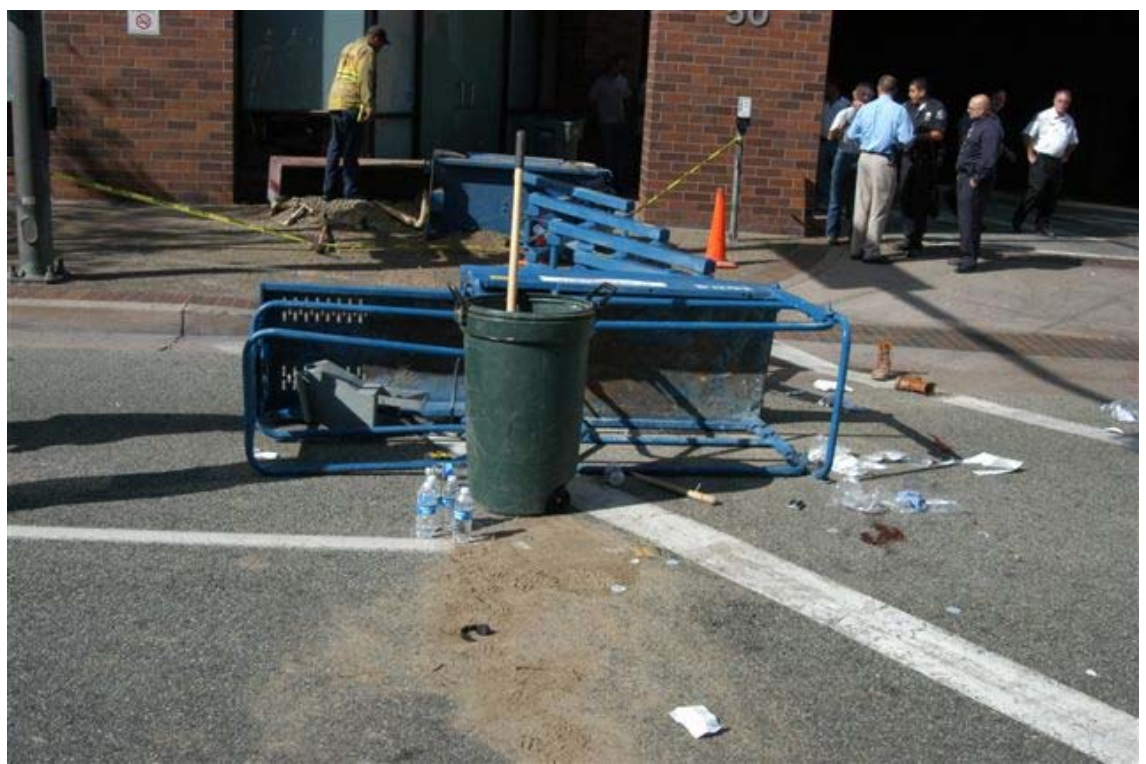
Exhibit 2. The work platform on the toppled scissor lift.