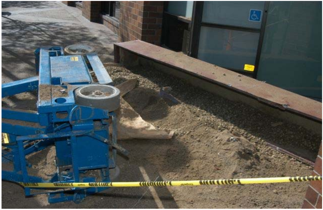
Exhibit 6. The dirt and gravel that was in the planter box when it fell off the ledge.