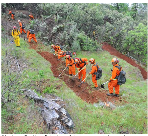
Digging a fire line disturbs soil that may contain cocci spores

Valley Fever is a fungal infection that usually affects the lungs. It is caused by the fungus Coccidioides immitis that lives in soil in many parts of California. When soil that contains this fungus is disturbed through digging by hand or with heavy equipment, or is disturbed by wind, the fungal spores get into the air. When people breathe the spores into their lungs, they may get Valley Fever (also called "coccidioidomycosis" or "cocci"). Often the illness is without any symptoms, but in many cases, a serious disease can develop which can cause a previously healthy individual to be hospitalized, miss more than one month of work, and/or die.