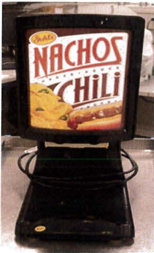
Cheese sauce dispenser