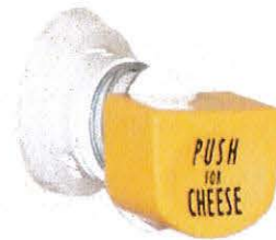
Valve (dispenser spout)