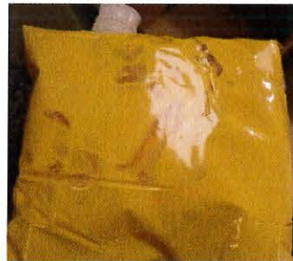
80 oz. (5 lb.) cheese sauce bag