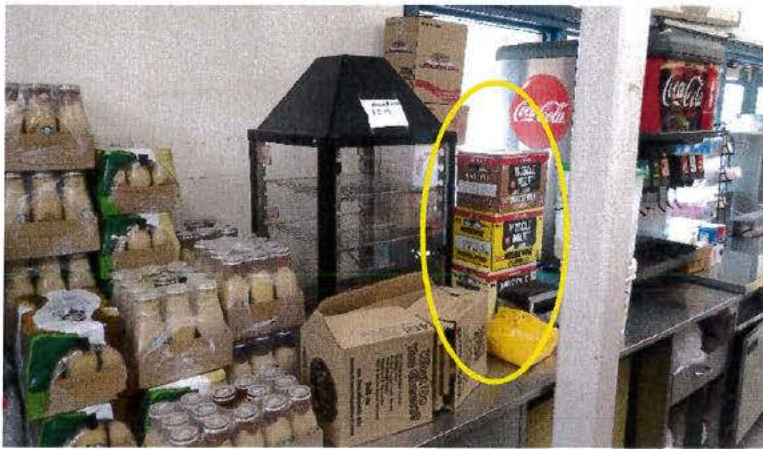
Figure B: Photograph of the location where the cheese sauce dispenser was stored at VOFF.

The warming case, used to keep the tortilla chips warm for the nachos, was found stored on top of a stainless steel storage cabinet located between the fountain drinks dispenser and the cases of bottled Starbucks coffee drinks. The Gehl's nacho cheese and chili sauce warming dispenser unit, impounded by SCPH on May 5, 2017, would have been located between the chips warming case and the fountain drinks dispenser (yellow circle on Figure B).