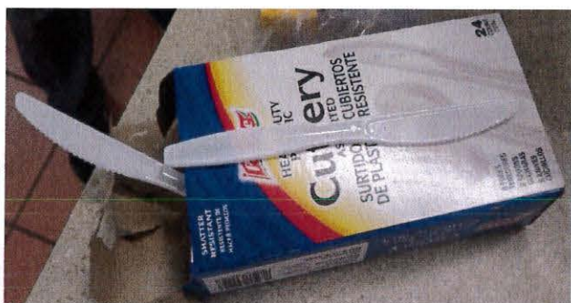
Figure D: Photograph of the box of plastic disposable knives where Mr. Singh obtained the plastic knife used to puncture the cheese sauce bag.

On May 12, 2017, FDB revisited VOFF in an attempt to locate the Gehl's puncture tool that would have been provided with the dispenser. The puncture tool could not be located at VOFF. Kuldip Singh, the nightshift employee, claimed that he never saw a puncture tool; instead, he used a clean disposable plastic knife to open the cheese sauce bag. The box of disposable plastic knives was collected by FDB as evidence (Figure D).