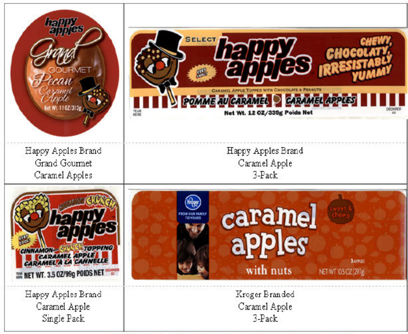
FIGURE 6 - SAMPLE HAPPY APPLE LABELS

The firm stamped a best by date on each package produced. The best by date was from the production date for all products and brands. This best by date served as a lot coding system as well (Exhibit B).