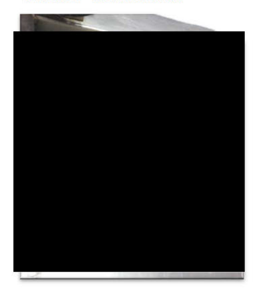
FIGURE 4 - FOAM SCRUBBERS

Happy Apples made all caramel onsite, in copper kettles, in their kitchen area. The ingredients in the caramel were primarily corn syrup and sugar (Exhibit A). According to information provided by Mr. Valenzuela, the employee making the caramel heated re to re several minutes, and then he is ixture to 232° F-234°F for a second cooking phase. After cooking, the employee of the apple dipping machine. In addition to caramel apples, the facility produced candy apples. Candy apples were