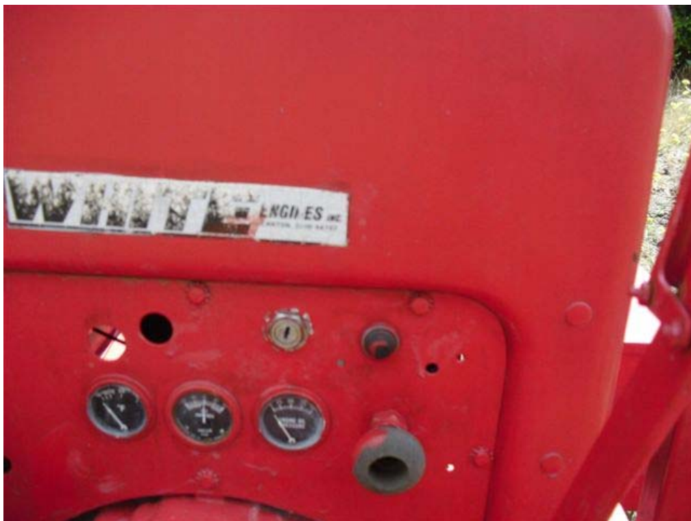
Exhibit 8. The control panel on the wood chipper.