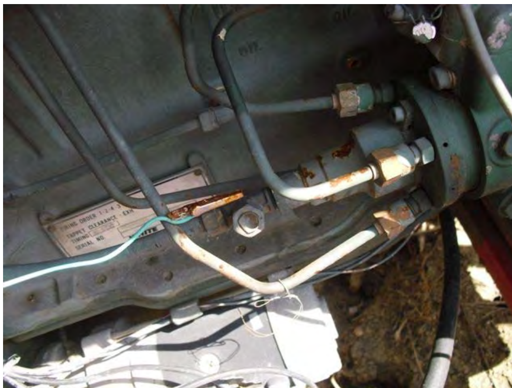
Exhibit 9. The wire clip used to shut off power to the wood chipper.