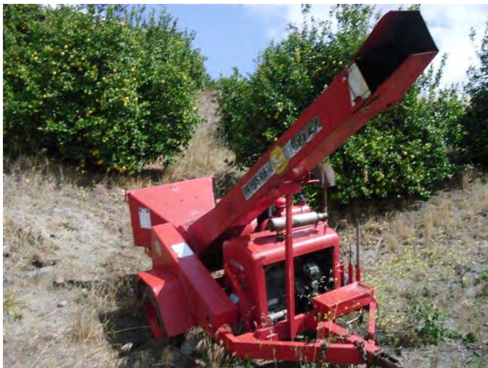
Exhibit 2. Front view of the wood chipper.