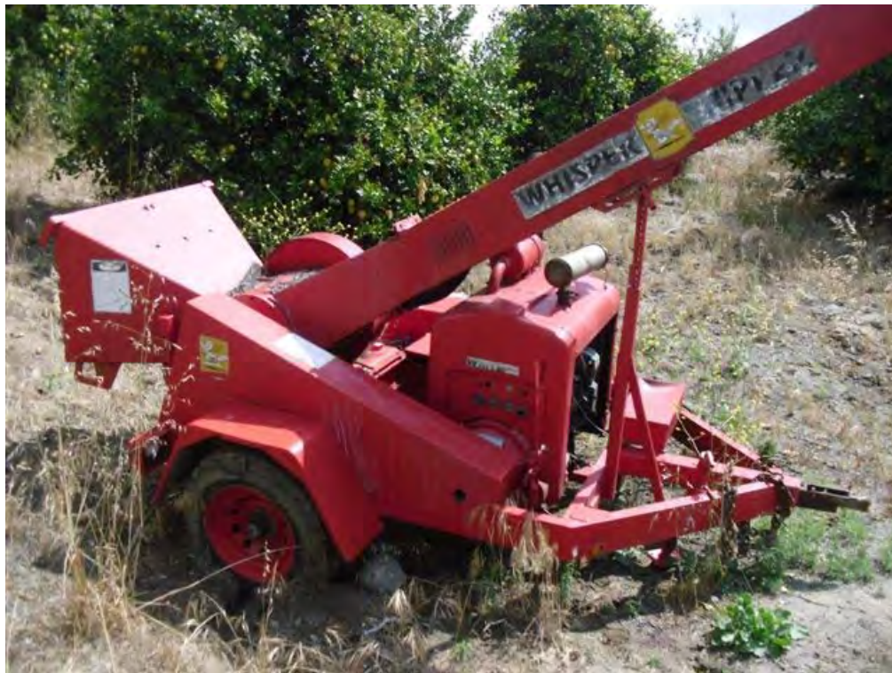
Exhibit 1. The wood chipper involved in this incident.