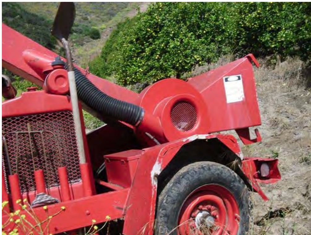
Exhibit 3. Side view of the wood chipper.