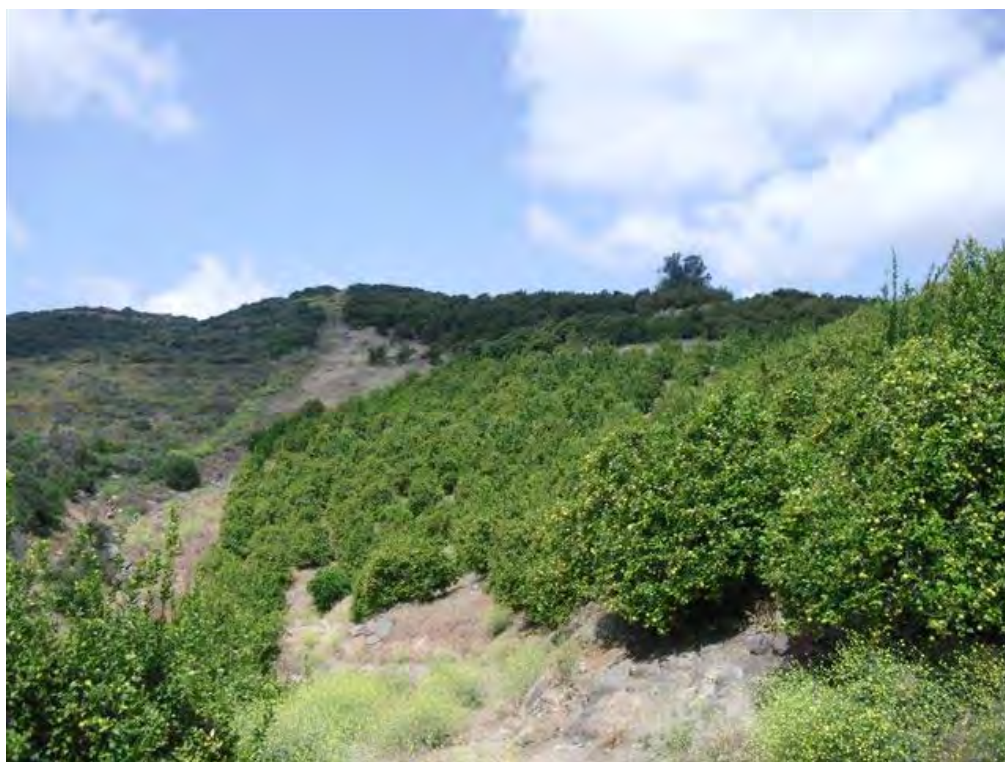
Exhibit 10. The steep hillside where the incident occurred.