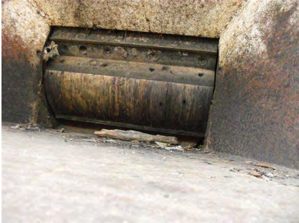
Exhibit 7. The blades attached to the rotating drum that chip brush.