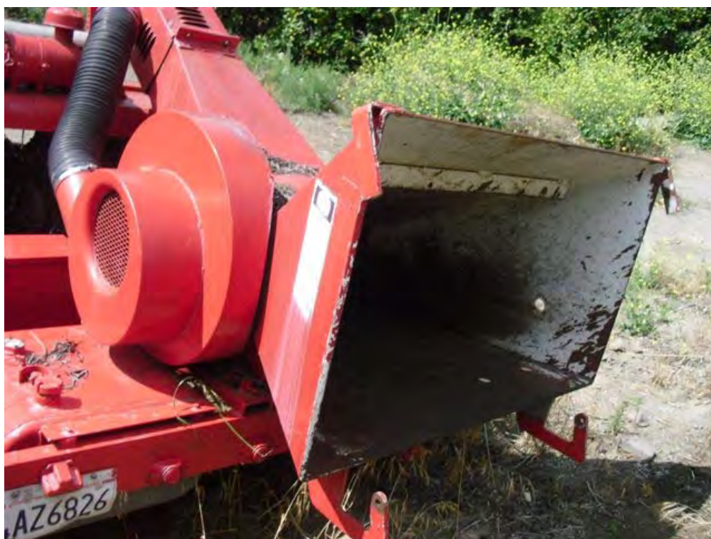
Exhibit 4. A rear view of the wood chipper.