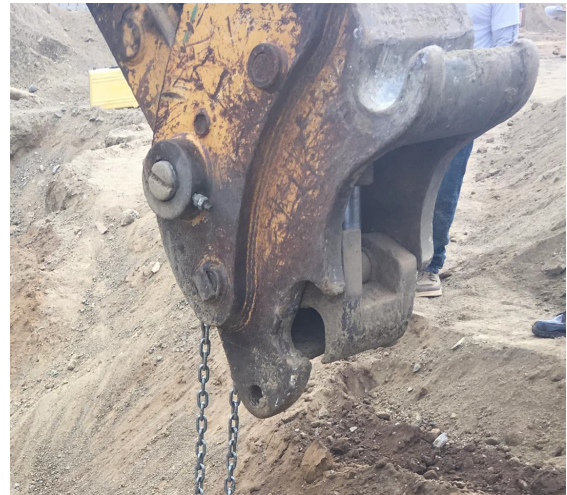
Exhibit 6. The quick coupler attached to the end of the boom.