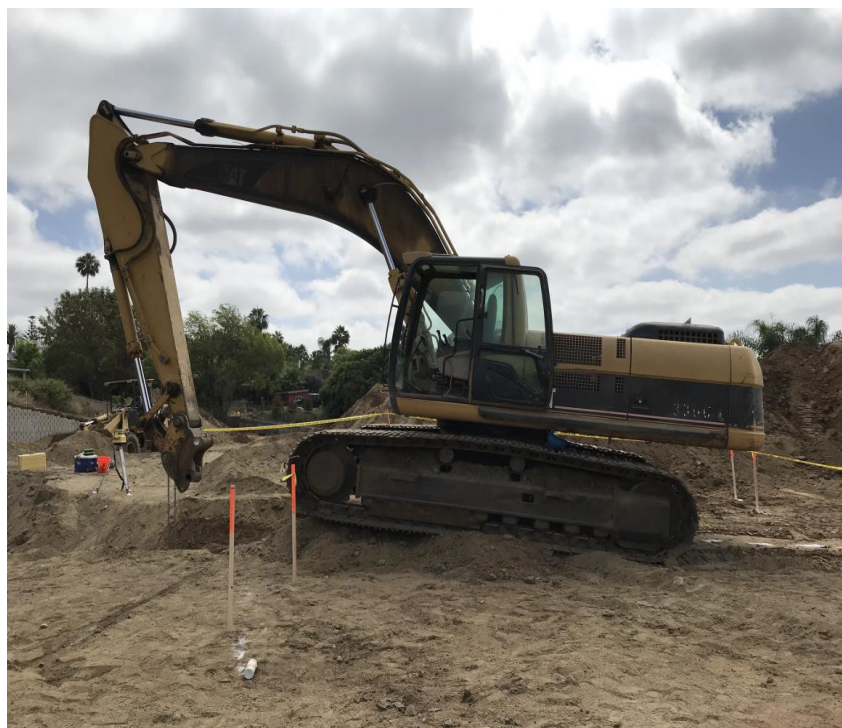
Exhibit 1. The excavator involved in this incident.

The incident scene was an outdoor construction site for new homes. The employer was installing underground sewer pipes, and had been at this worksite for six weeks prior to the incident. The only two people onsite the day of the incident were the victim and the employer who was also the operator of the excavator. The excavator machine (330) and quick coupler involved in this incident were both manufactured by Caterpillar (Exhibit 1). Quick couplers are hydraulic devices that are installed at the end of booms by pins that would normally be the mountings for the bucket or attachment. They facilitate the rapid exchange of working tools or buckets.