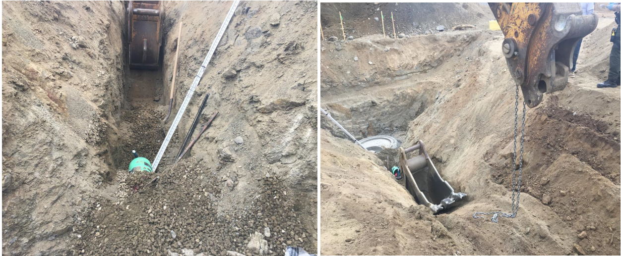
Exhibit 2 and 3. Alternate views of the trench.

At the time of the incident, the excavator operator was digging an additional trench next to existing underground sewer pipes. The new trench was going to accommodate more pipes that would be tied into the current sewer system (Exhibits 2 & 3). The depth of the trench was approximately nine feet. The deepest four feet were straight-sloped and wide enough to accommodate the new polyvinyl chloride (PVC) sewer pipes (Exhibit 4). The victim was likely in the trench acting as a spotter to signal to the operator where to move the bucket so that it would not damage existing pipe already in the trench.