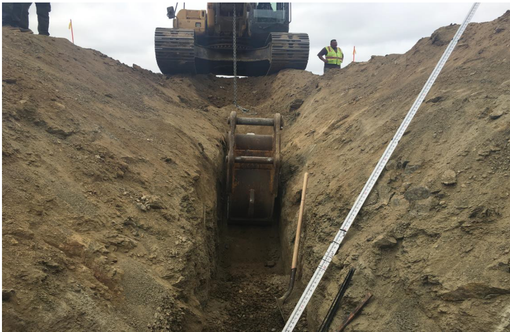
Exhibit 4. Slope and depth of the trench.