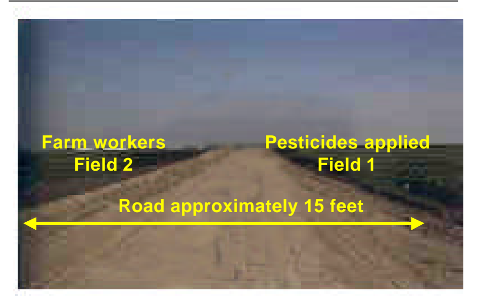
Figure 2. Proximity of farm workers to pesticide treated field

Of the 16 workers who left work, nine subsequently sought medical care independently. Eight sought care on the day of the incident and were hospitalized overnight; one did so three days later and received outpatient treatment. Among the nine workers who sought care, the delay between leaving work and receiving care ranged from one to 76 hours (median = 5 hours).