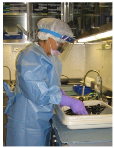
Hospital workers are exposed to harmful disinfectants

Work-related asthma (WRA) is asthma that is caused or made worse by something at work. Studies show that between 15-30% of all adult asthma is caused by conditions or chemicals at work. There are over 320 substances known to cause new asthma in people who did not have it before. A few examples include flour, some cleaning chemicals, certain welding fumes, latex, animal dander, epoxies, chlorine, isocyanates, formaldehyde, wood dust, some disinfectants, and metalworking fluids.