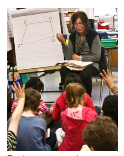
Teachers are exposed to many substances that can cause or trigger asthma, including cleaning products

Ask your doctor and tell your supervisor if you think that your breathing problems could be related to your work. Your supervisor may send you to see a doctor who focuses on work-related health problems. Write down the exact names of the chemicals or products you work with or that are used in your work area.