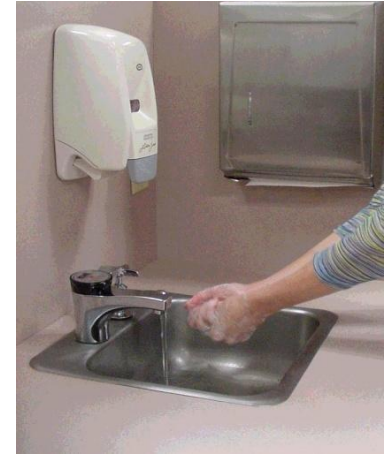
3) Scrub backs of hands, wrists, between fingers and under fingernails