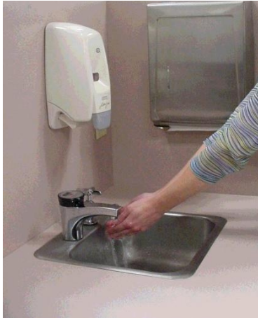
1) Wet hands with warm water