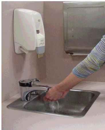
4) Rinse hands with warm water