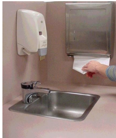
5) Dry hands with single use paper towels or by use of a forced air hand drying device