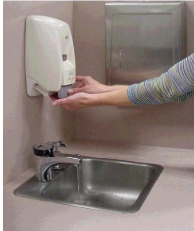
2) Lather hands with soap for at least 20 seconds